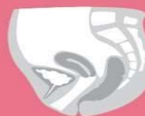
Inspection of vulva, vagina, cervix and anus, done visually and by touching