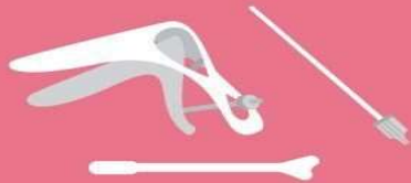
Speculum, small spatula and brush