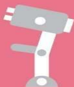
Screens for cervical cancer