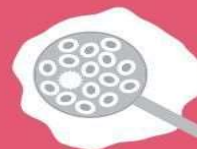
Detects infections, diseases, cysts and fibroids