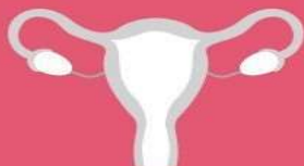
Speculum opens the vagina and the spatula and brush collect cervix cells